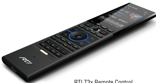
RTI T3x Remote Control

"Since so many people in our family use the gaming room, flexibility and simplicity were absolute priorities when we were designing the space," said the homeowner. "We wanted the kids to be able to just touch a few buttons and begin playing on their own TVs without any confusion or assistance from us. With extras like coordinated LED lights on the rack that light up to instantly tell the kids what's going on with the system, it creates a fun atmosphere where they can hang out with their friends without needing to plug in equipment or turn any sound or video components on or off. When you've been gaming as long as I have, you get to see a fair share of setups, and this certainly stands out as something special and unique. I'm definitely enjoying it just as much as they do!"