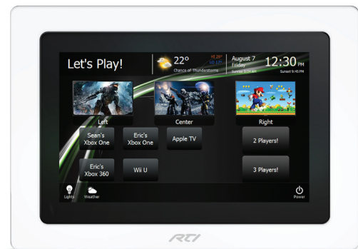
RTI KX7 7" In-Wall Touchpanel With Custom Interface

things to give the client and his kids exactly what they had in mind." Set up within a 20-by-12-foot space, the innovative gaming room uses RTI's powerful XP-6 control processor to integrate its numerous components into one straightforward control system. Equipped with an impressive feature set that rivals processors at much higher price points, the XP-6 is capable of bi-directional communication with third-party devices such as security, lighting, and HVAC systems, as well as A/V components. Using RTI's powerful Integration Designer® programming software, the integrator custom designed the user interfaces specifically for this game room. The unique programming included the equipment rack's RGB lights that switch to green when a user activates an Xbox®, turn blue when the Wii U is selected, and turn red when the system is