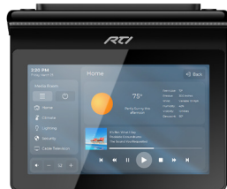
Under Cabinet Mount (Inverted)