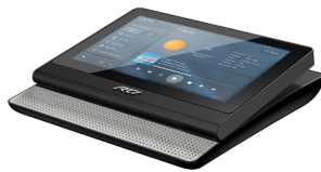
Screen Tilt - 10°