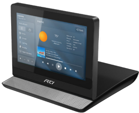
Screen Tilt - 90°