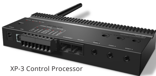
XP-3 Control Processor

Warranty..... Three Years (Parts & Labor) / ..... One Year on the battery (T2x) All Specifications subject to change without notice.