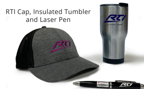
RTI Cap, Insulated Tumbler and Laser Pen