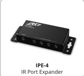
IPE-4 IR Port Expander