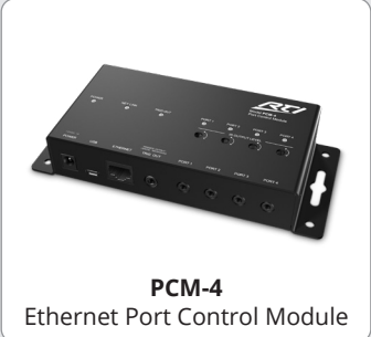
PCM-4 Ethernet Port Control Module