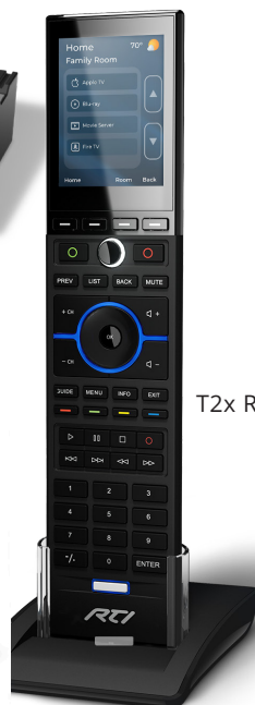
T2x Remote Control