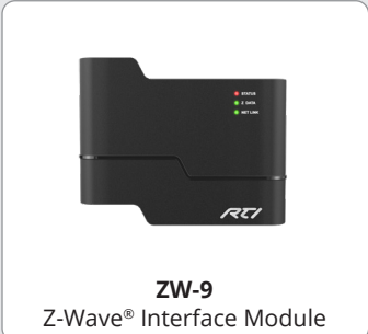
ZW-9 Z-Wave® Interface Module