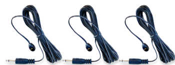
vIRsa Mouse IR Emitters