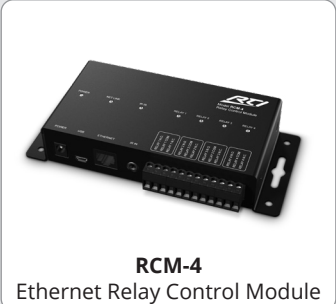
RCM-4 Ethernet Relay Control Module