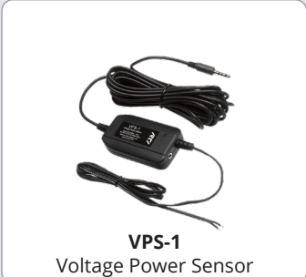
VPS-1 Voltage Power Sensor