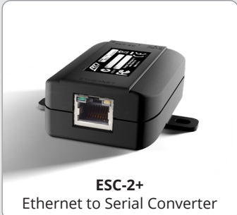
ESC-2+ Ethernet to Serial Converter