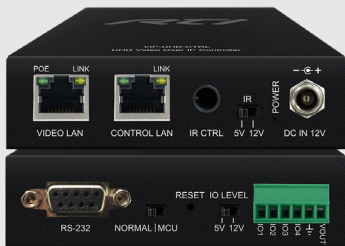
VIP-UHD-CTRL Video over IP Control Module