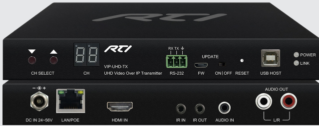
VIP-UHD-TX 4K Video over IP Transmitter