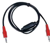
IRC-SM12V Infrared Adapter Cable for VIP- UHD-TX & VIP-UHD-RX

The RTI Video over IP (VIP) distribution platform enables distribution of 4K video over a 1Gb Network switch to virtually unlimited endpoints. The result is an exceptionally flexible and scalable system that can be installed in minutes and controlled natively within the RTI control environment.