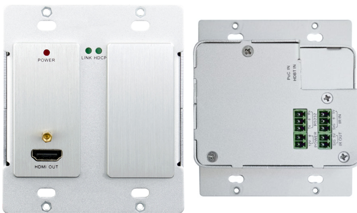
VWS-21R HDBaseT Wall Plate Receiver