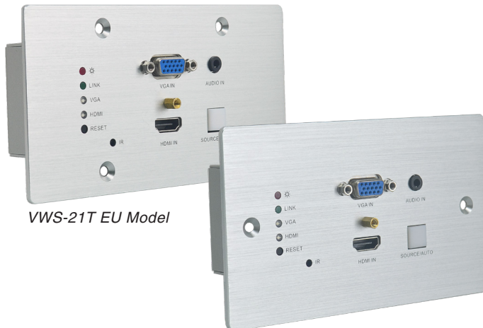
VWS-21T EU Model