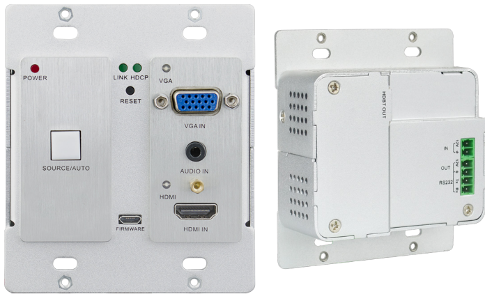
VWS-21T HDBaseT Wall Plate Transmitter